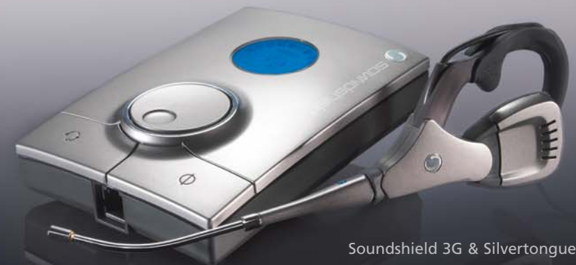
Soundshield 3G & Silvertongue 330

When paired with the stylish, Australian designed Silvertongue headset range, Soundshield 3G delivers the safest & most comfortable solution for headset users while providing the unique option of an in use light on the Silvertongue headset.